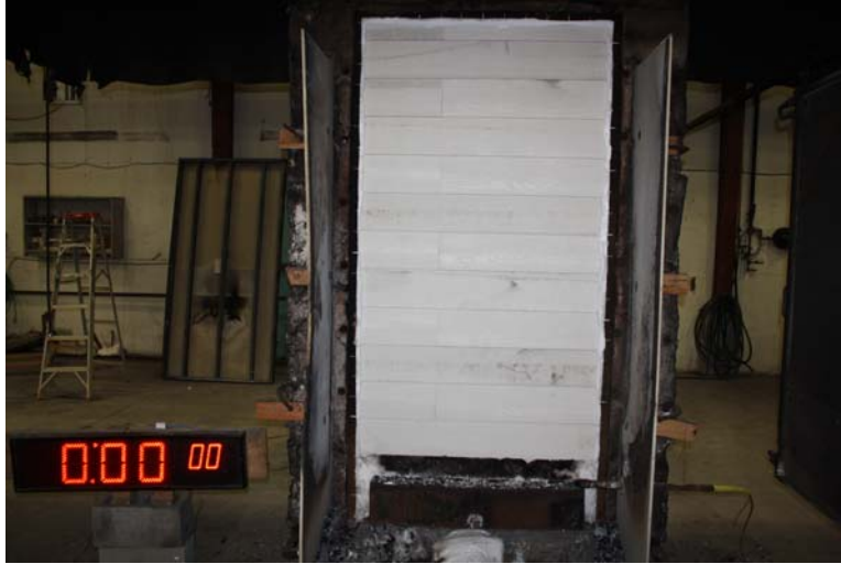
Test Series No. 1: Completed test assembly – Lap Siding