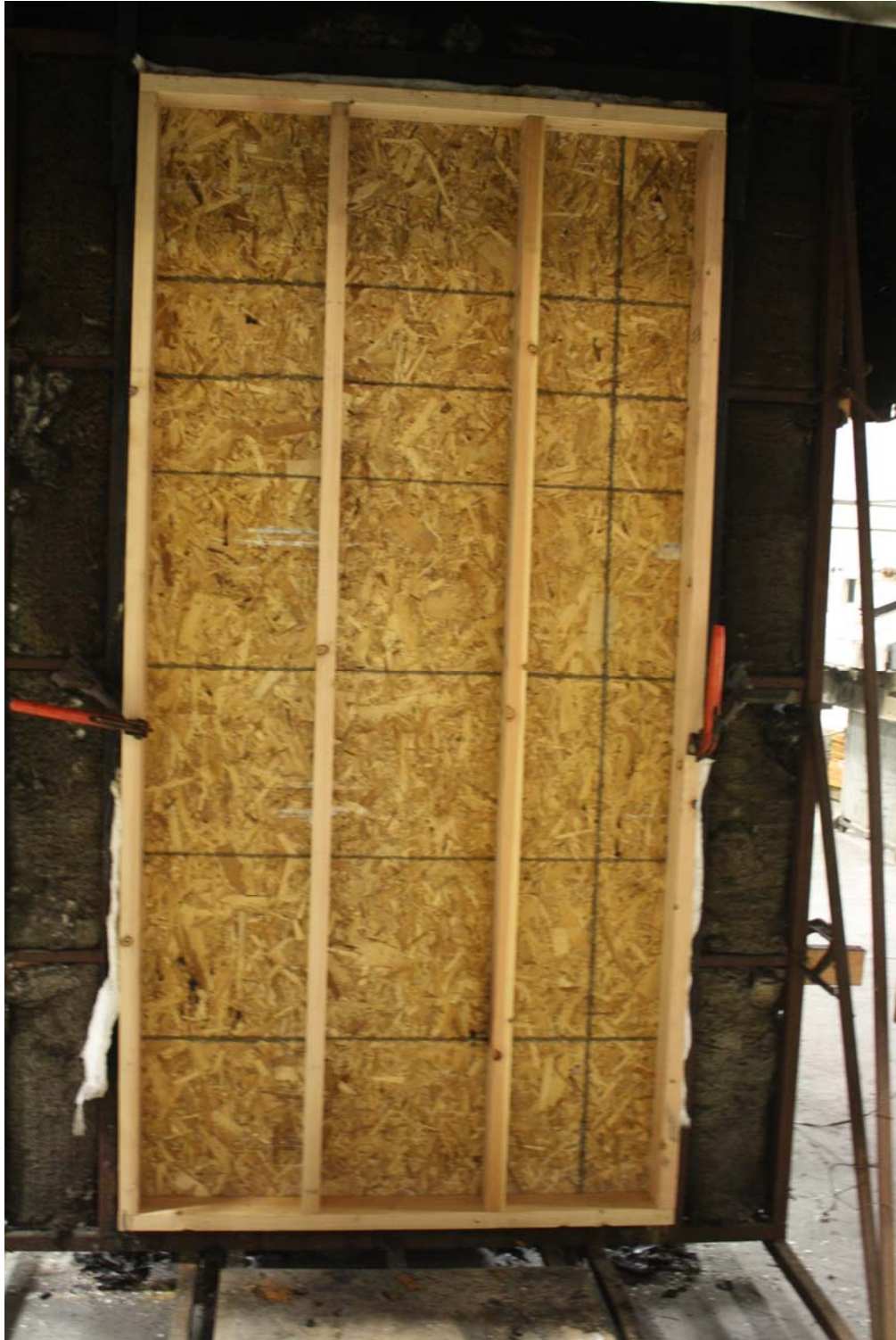
Unexposed face at test termination