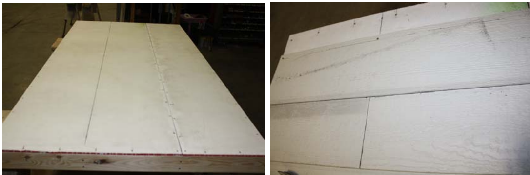
Test Series No. 1: Construction Photographs – Lap Siding (note butt joints every other course)

Conditioning: Prior to assembly, the FlameBlock sheathing, lap siding and cedar sidewall shingles were conditioned to equilibrium moisture content at 70±5°F and 50±5% relative humidity. The test assemblies were tested shortly after construction.