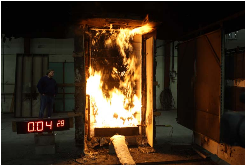
Midway through burner exposure