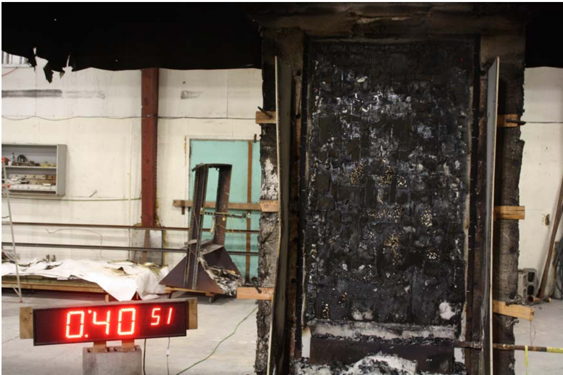
Exposed face at T = 41 minutes