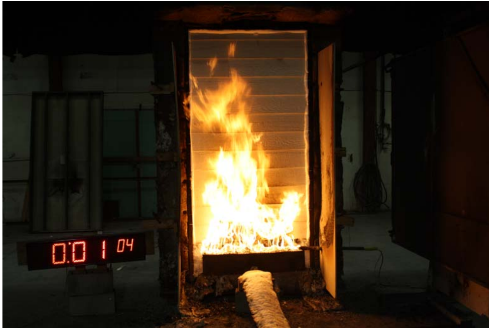
Test time = 1 minute