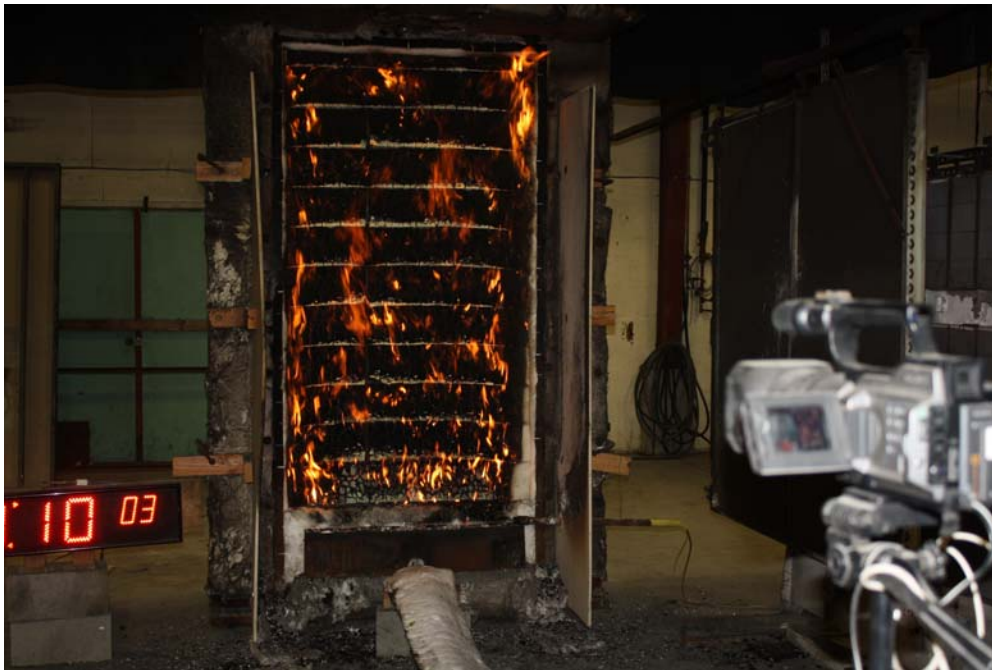
Immediately after termination of burner