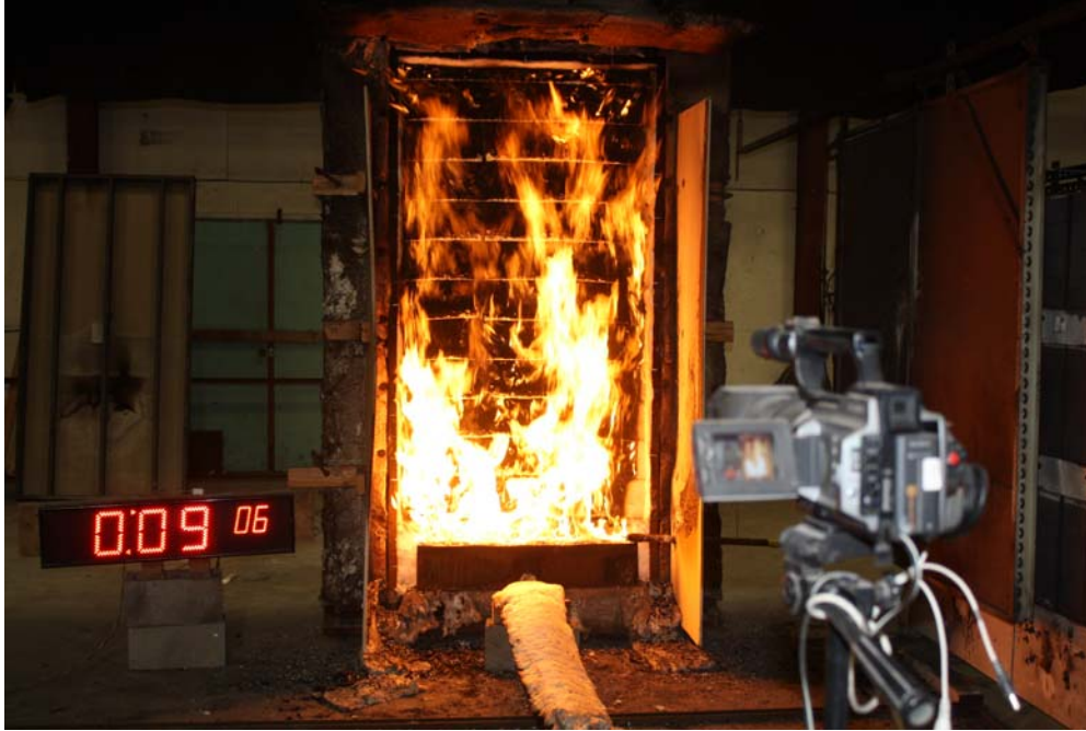
Prior to burner termination