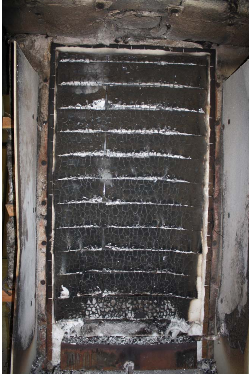
Exposed face at test termination