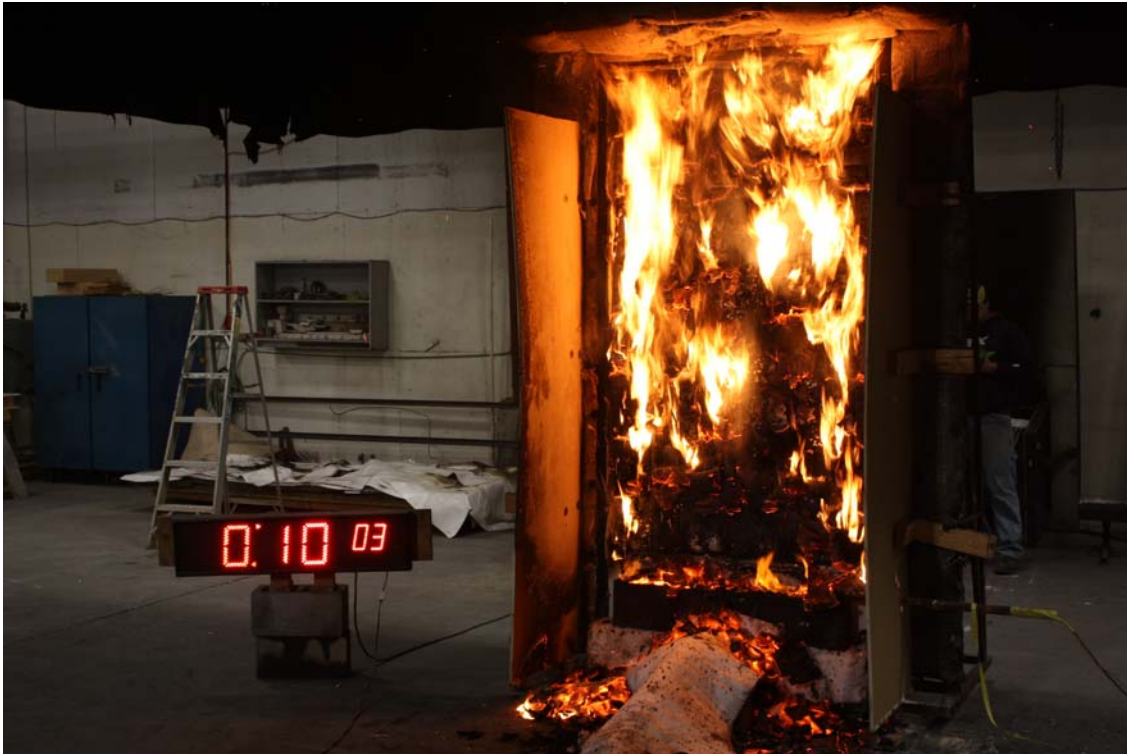
Termination of burner exposure