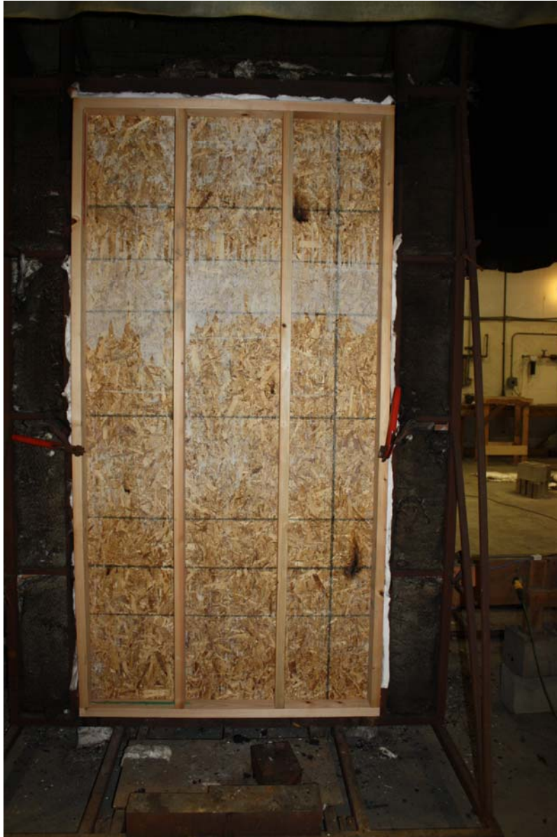
Unexposed side at test termination