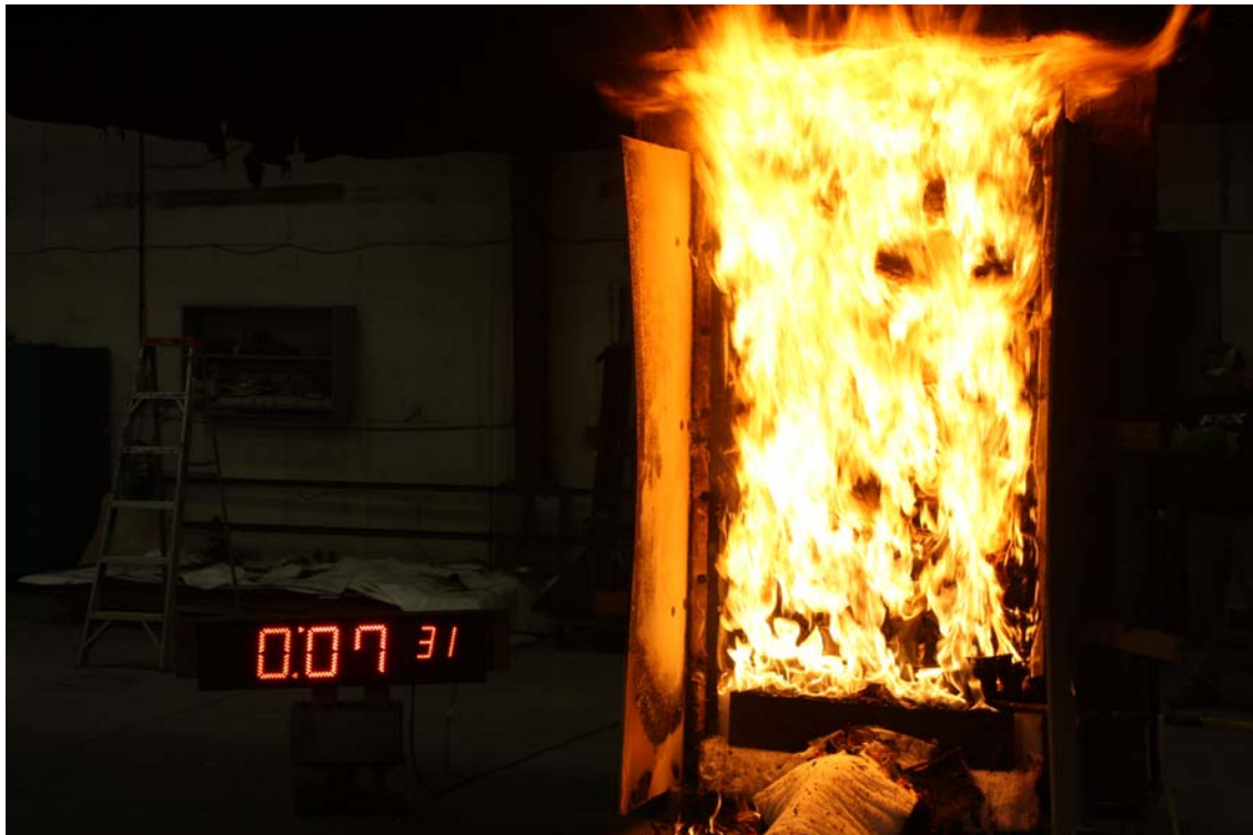
T = 7.5 minutes