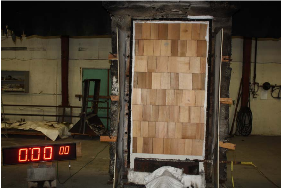
Prior to test