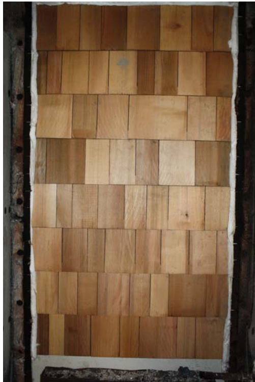
Test Series No. 2: Completed Wall Assembly